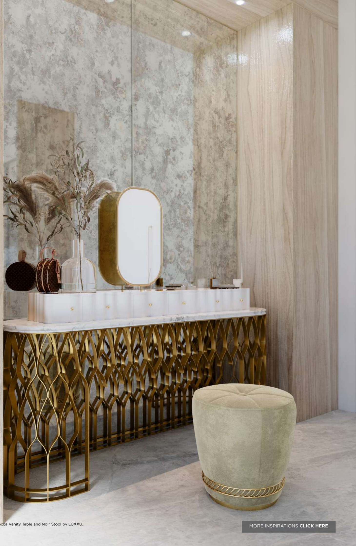
Mecca Vanity Table and Noir Stool by LUX XU.