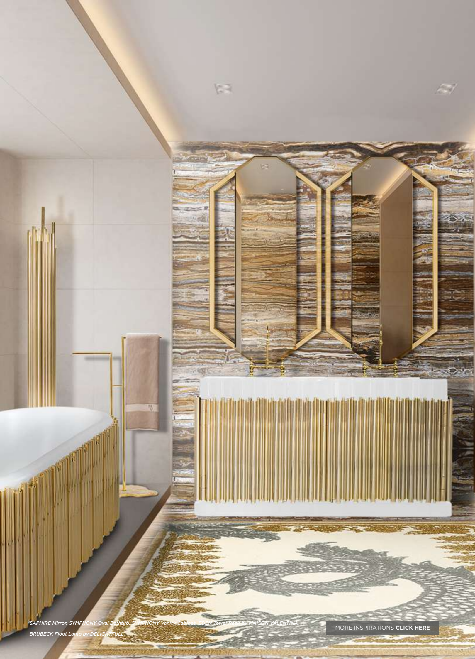
SAPHIRE Mirror, SYMPHONY Oval Bathtub, SYMPHONY Vanity Cabinet, EDEN Towel Rack by MAISON VALENTINA, BRUBECK Floor Lamp by DELIGHTFULL