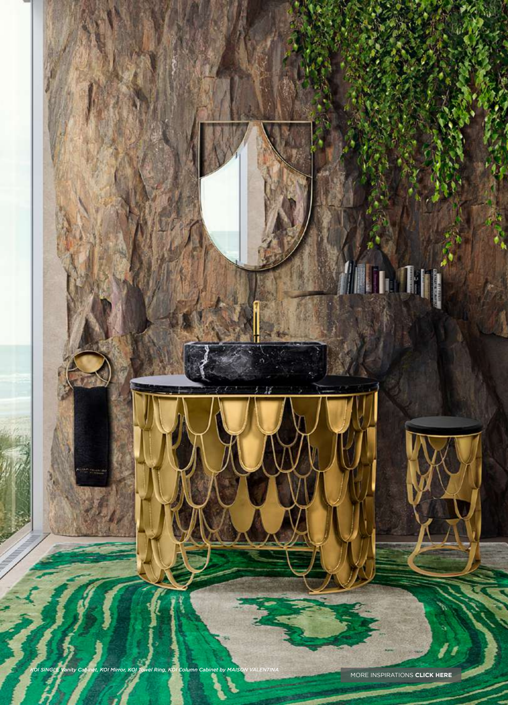
KOI SINGLE Vanity Cabinet, KOI Mirror, KOI Towel Ring, KOI Column Cabinet by MAISON VALENTINA