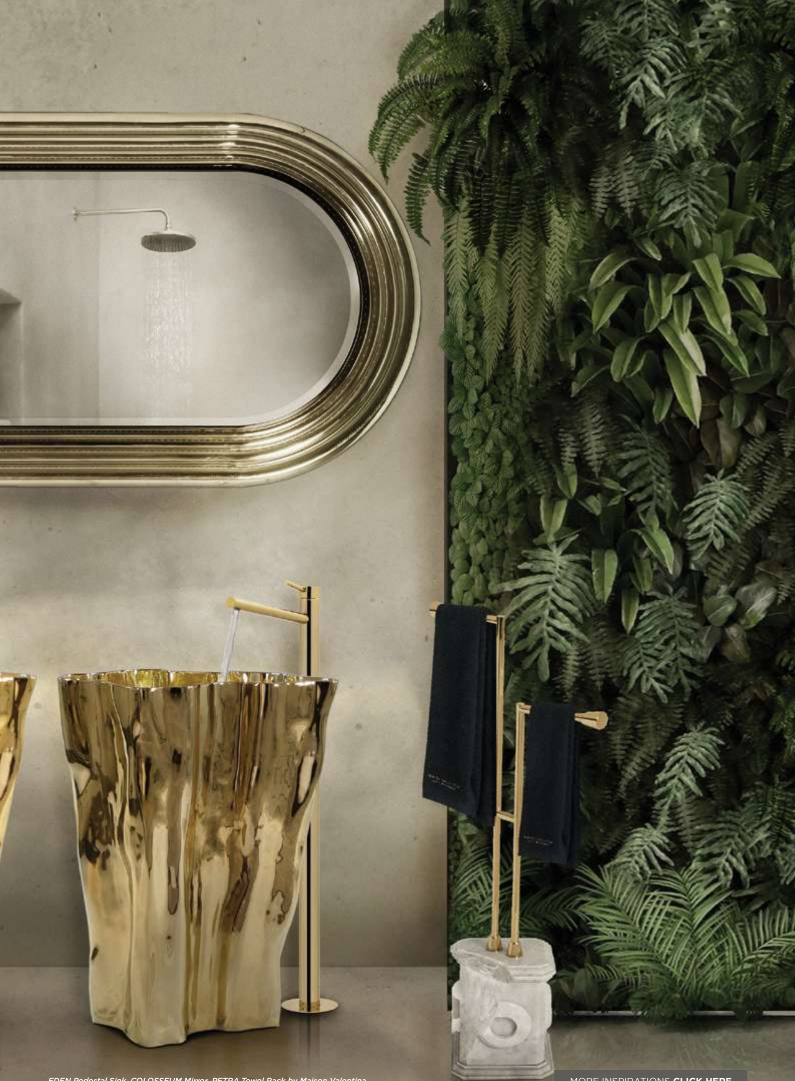
EDEN Pedestal Sink, COLOSSEUM Mirror, PETRA Towel Rack by Maison Valentina