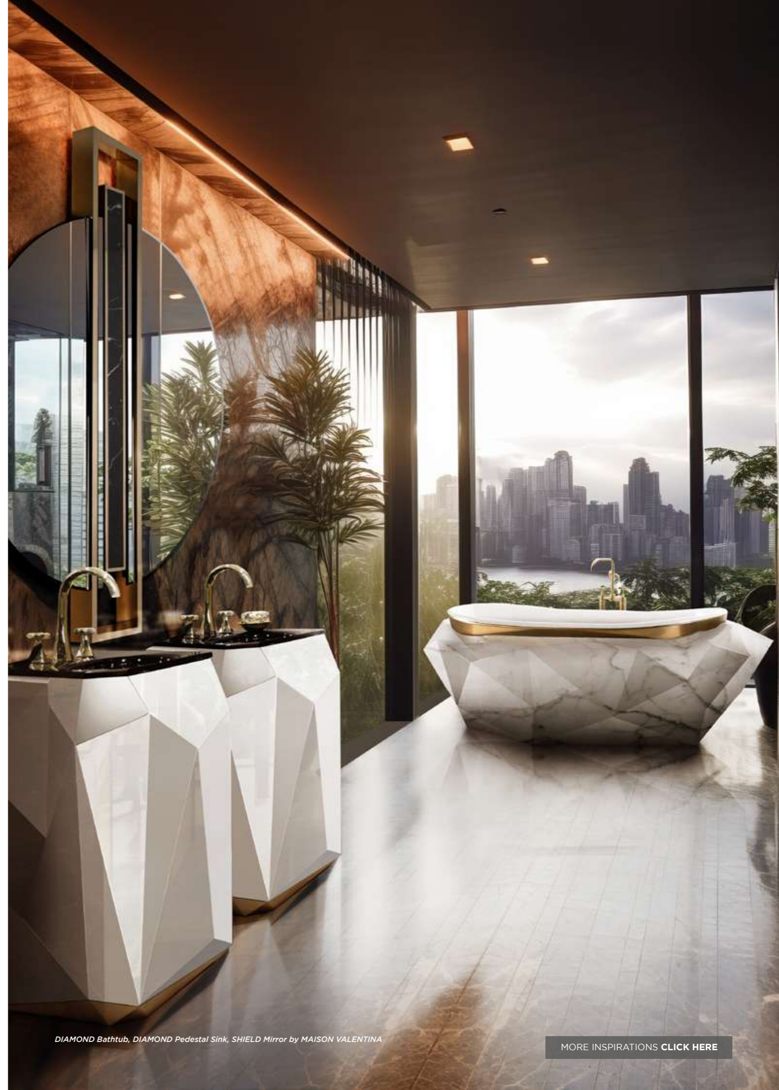
DIAMOND Bathtub, DIAMOND Pedestal Sink, SHIELD Mirror by MAISON VALENTINA

Opulent fixtures and accessories such as freestanding bathtubs, mirrors, and brass or gold faucets can improve the overall look and lend an air of luxury. Creating a calm haven that expresses your style with thoughtful material selection and creative furnishings is possible. The Diamond Bathtub with an elegant golden rim and a sleek fiberglass design with a black high-gloss finish gives this bathroom design the perfect touch and the Shield Mirror , made from Nero Marquina marble, polished brass, and mirrored glass, proves to be a great accent to any contemporary bathroom .