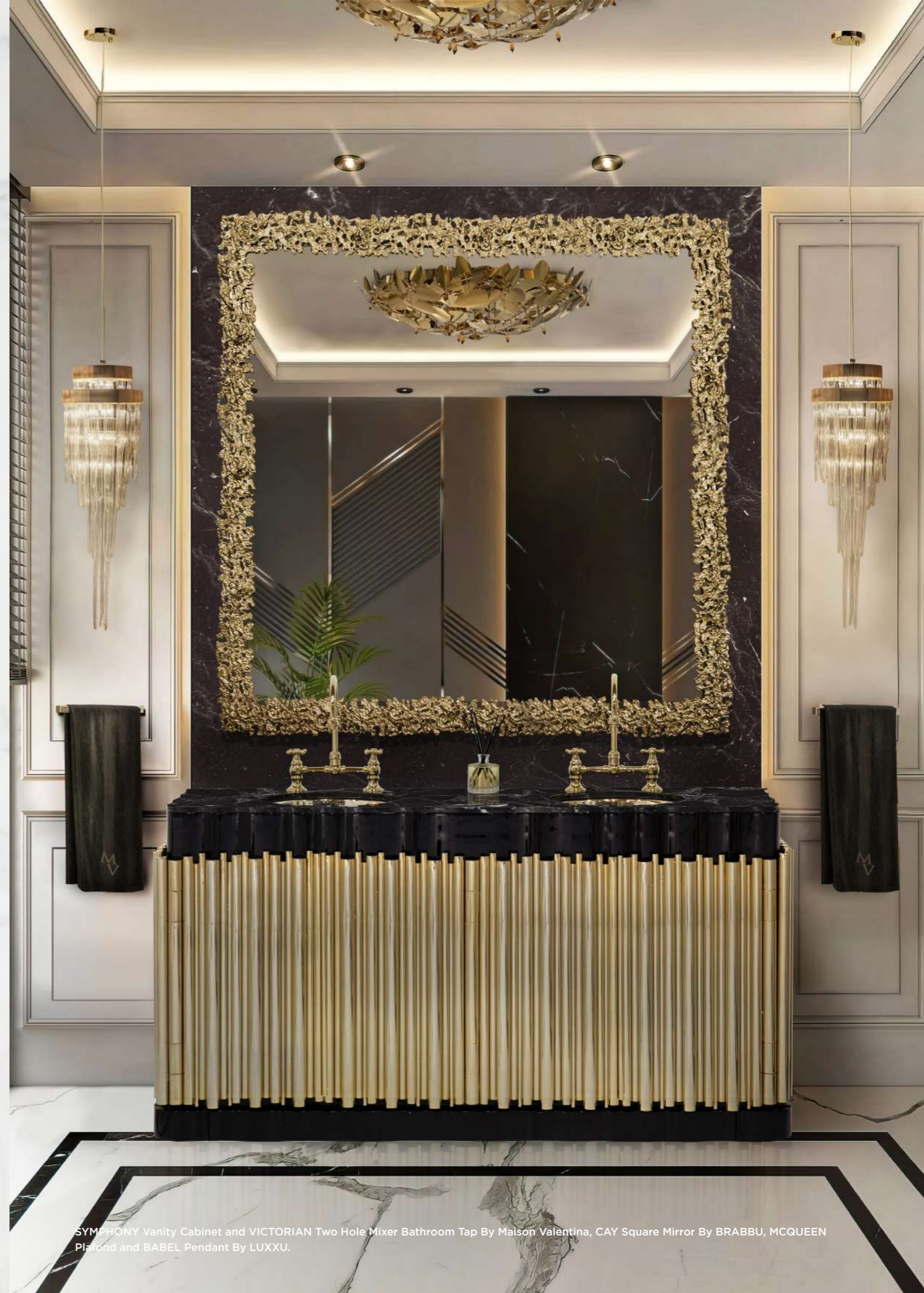
SYMPHONY Vanity Cabinet and VICTORIAN Two Hole Mixer Bathroom Tap By Maison Valentina, CAY Square Mirror By BRABBU, MCQUEEN Plafond and BABEL Pendant By LUXXU.

One inspiration, multiple options. You choose.