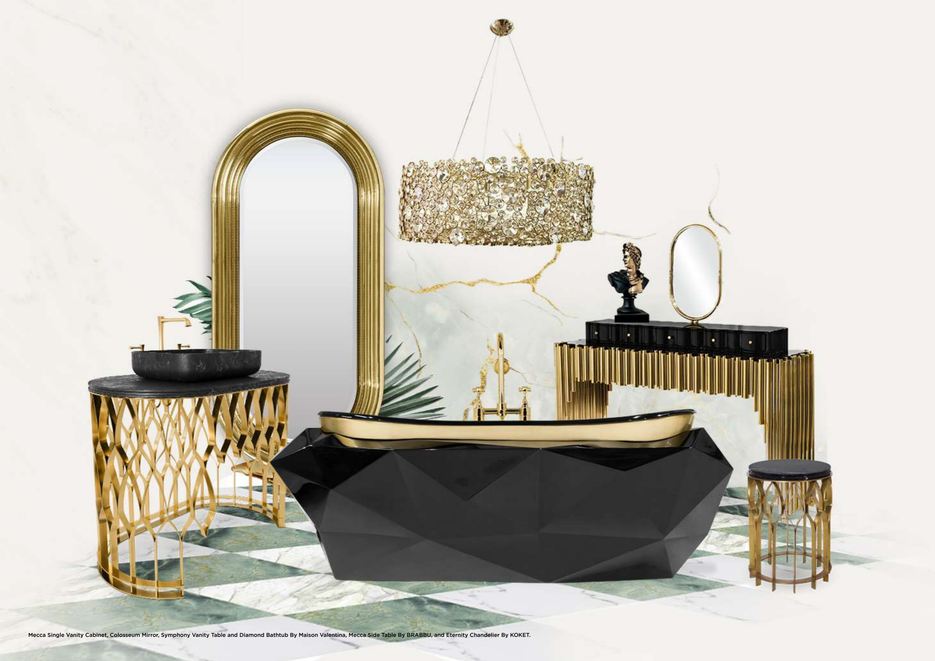
Mecca Single Vanity Cabinet, Colosseum Mirror, Symphony Vanity Table and Diamond Bathtub By Maison Valentina, Mecca Side Table By BRABBU, and Eternity Chandelier By KOKET.